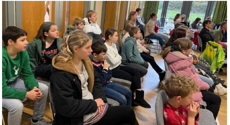
Die Heiland is gebore...